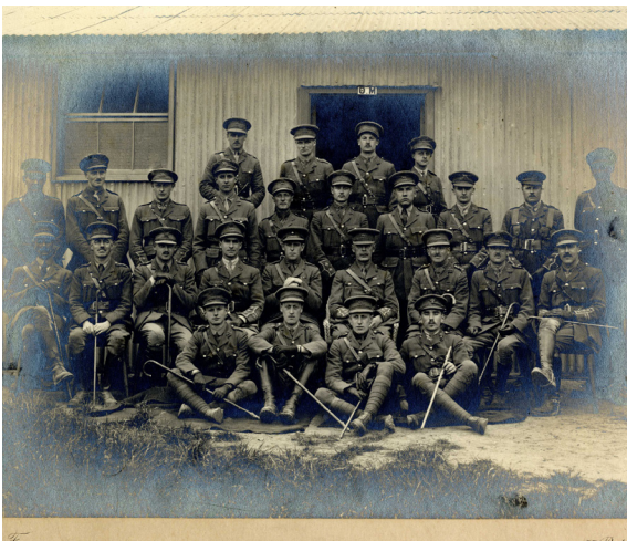
Officers of Queen's Royal West Surrey Regiment, 1916